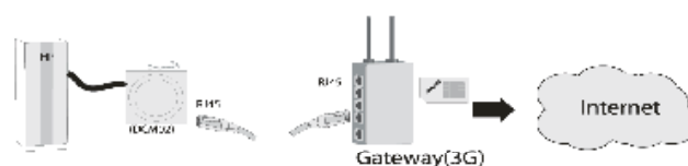
The customer's own mobile 3G gateway

In cases where broadband is not available, internet connection can be solved via an external 3G or 4G modem.